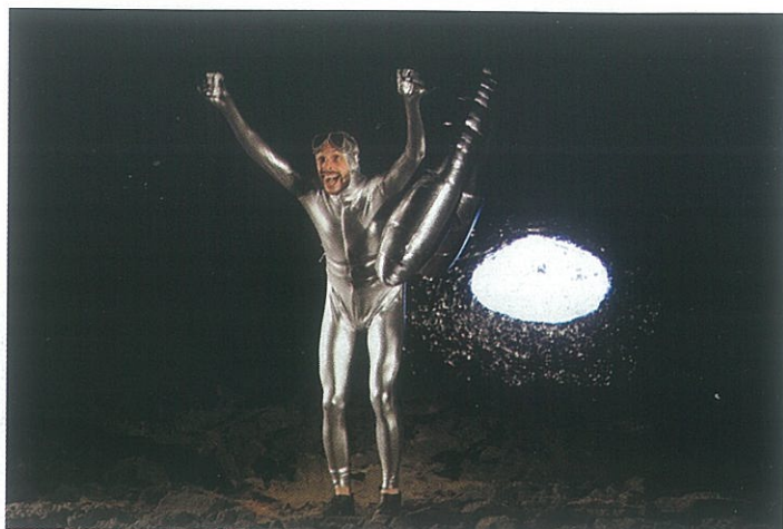
Left, top: Goshka Macuga, Where Is My Alien? , 2015. Performance view, Stromboli, Italy, July 25, 2015.